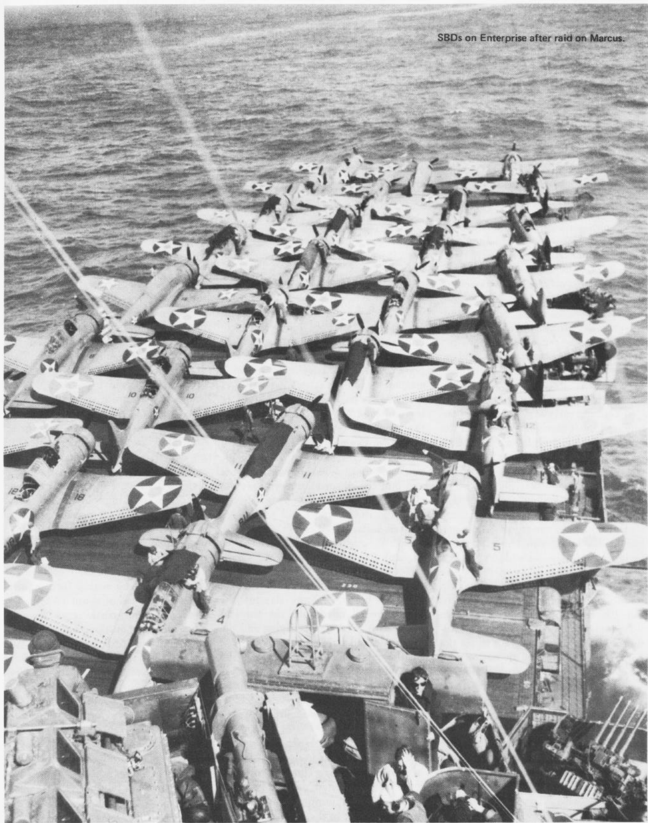
SBDs on Enterprise after raid on Marcus.