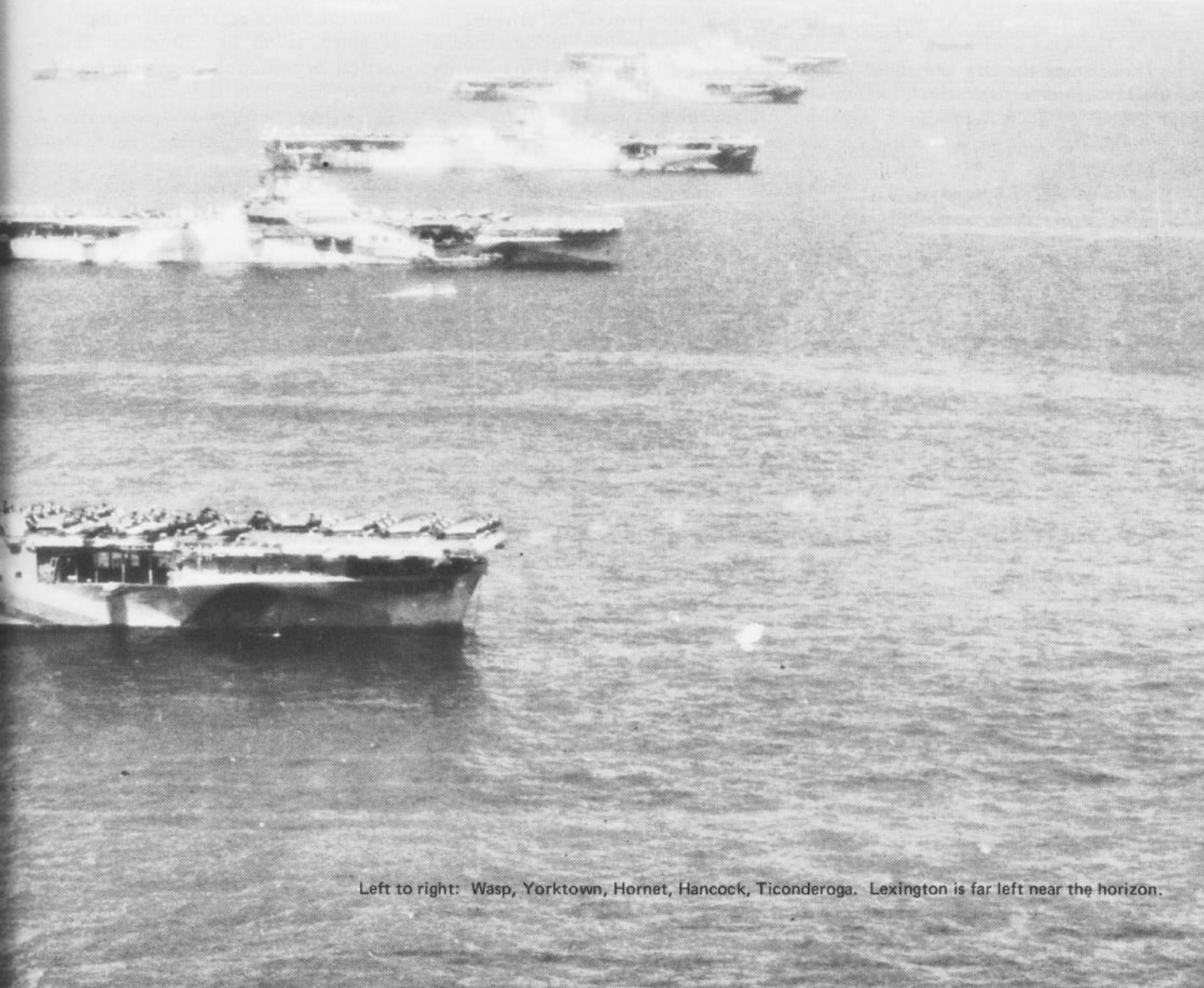
Left to right: Wasp, Yorktown, Hornet, Hancock, Ticonderoga. Lexington is far left near the horizon.

The job of a fast carrier was to take the naval war to the Japanese warships, aircraft, merchant marine and island bases. In the Navy's words, the fast carriers "were primarily an offensive weapon used to gain control of vast sea areas and to destroy enemy forces which threatened friendly fleets or amphibious operations." The task